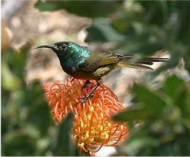
A sunbird perched on a protea, one of the dozens of protea species represented at the park.