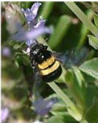
This one is a bit smaller, it's about 1.5 times as big as my thumb.