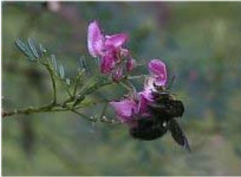
That's a tree branch. The bug is about half as big as my fist.