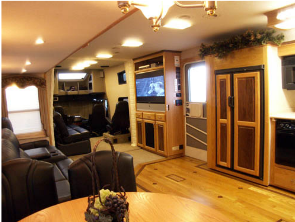
This new triple slide is HUGE with an UNMATCHED 378 square feet of top quality Luxury & Convenience at an UNBEATABLE PRICE