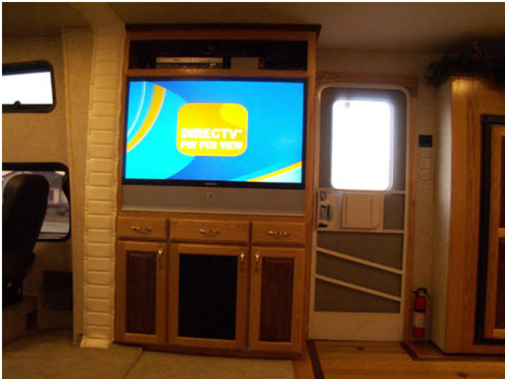
50 inch LCD Big screen TV with surround sound and live tracking satellite