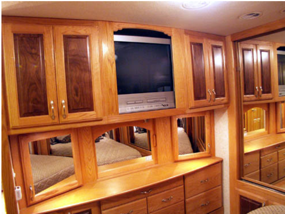
27 inch flat screen Tv with DVD and VCR built in