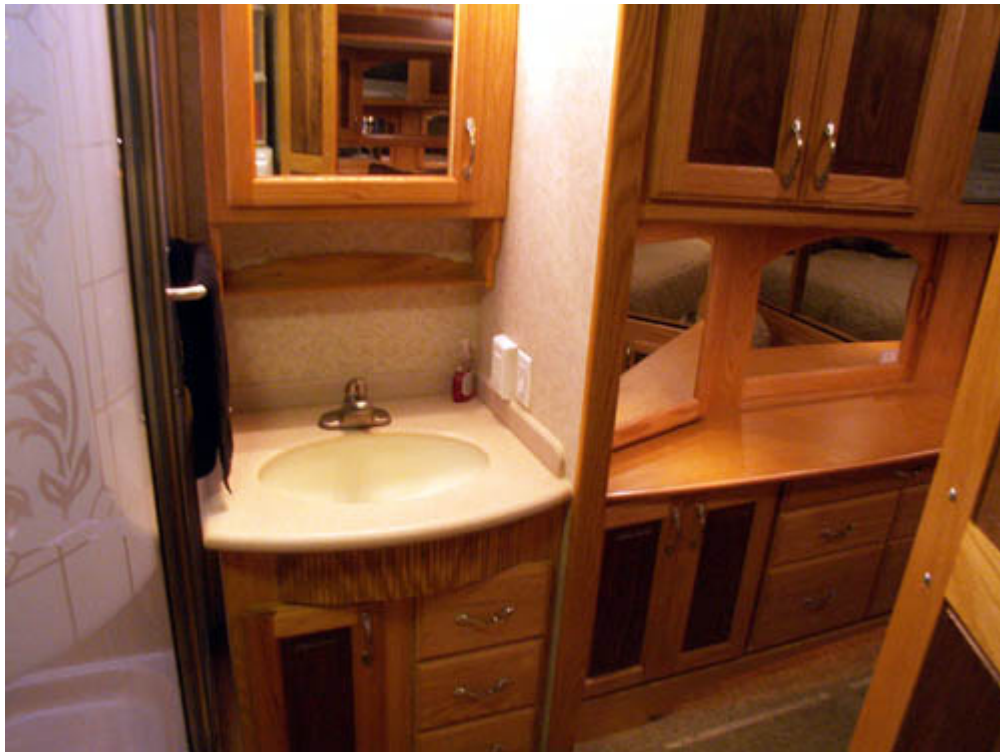
Corian counter tops throughout the coach very nice & easy to keep clean