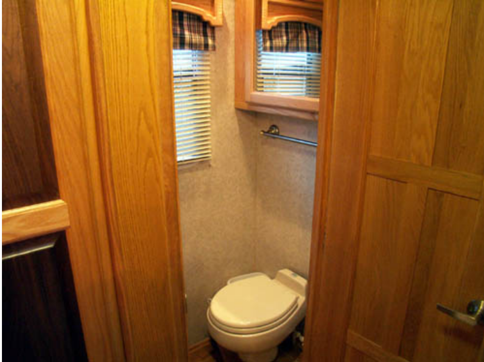
Large porcelain toilet in its own private room with a REAL SOLID HARDWOOD DOOR