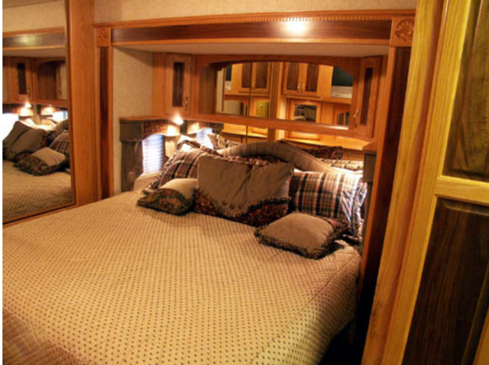
King size bed with lots of storage underneath it