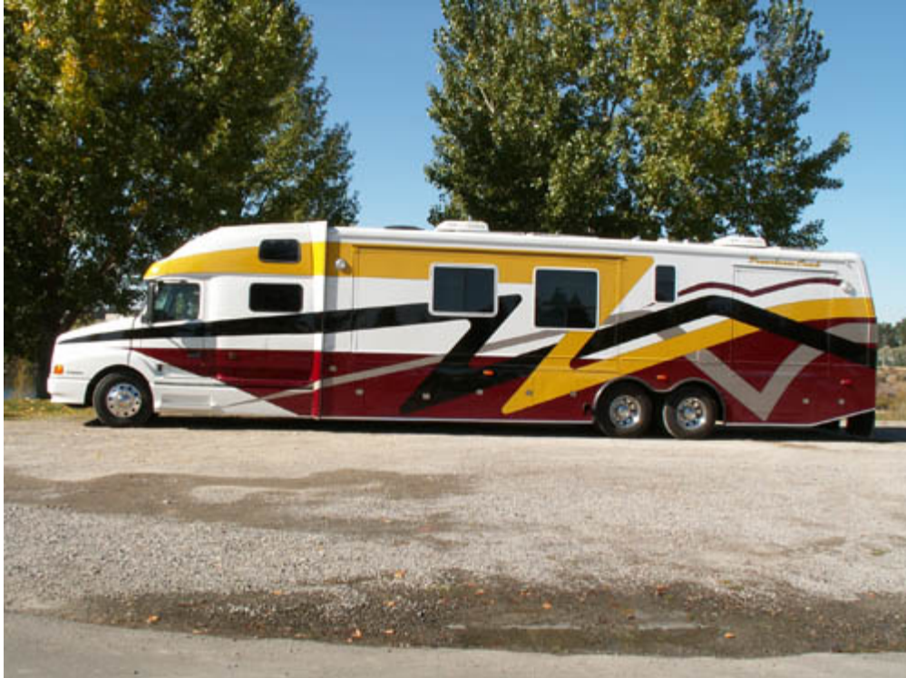
This new triple slide is HUGE with an UNMATCHED 378 square feet of top quality Luxury & Convenience at an UNBEATABLE PRICE