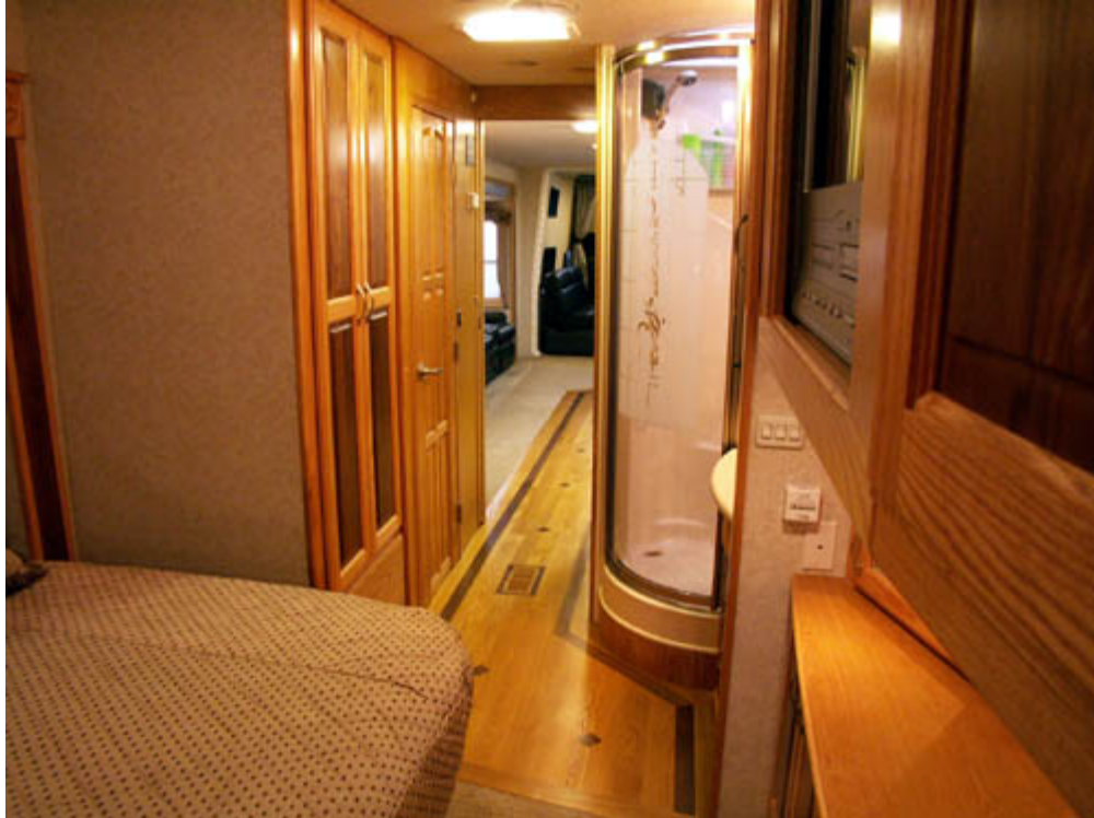
Very open and roomy bedroom bathroom area with a solid hardwood pocket door for privacy from main room