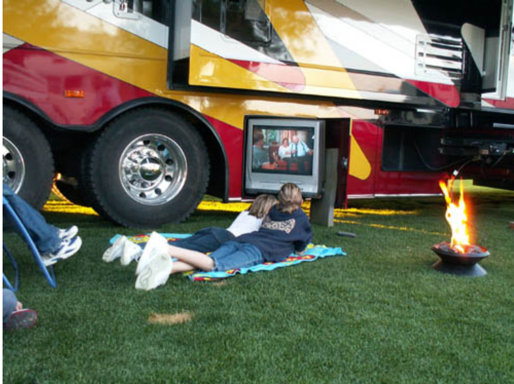
Outside under the awnings enjoy a refrigerator roll out 27 inch Tv with DVD / VCR and a roll out barbecue grill even a propane camp fire