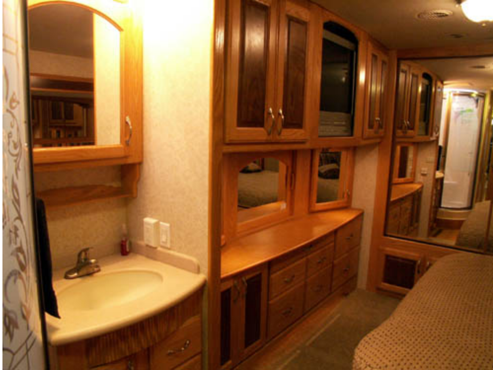
Lots of drawer space and a built in cloths hamper