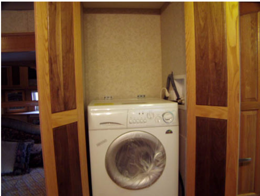
Outside vented washer dryer combo unit and additional closet space