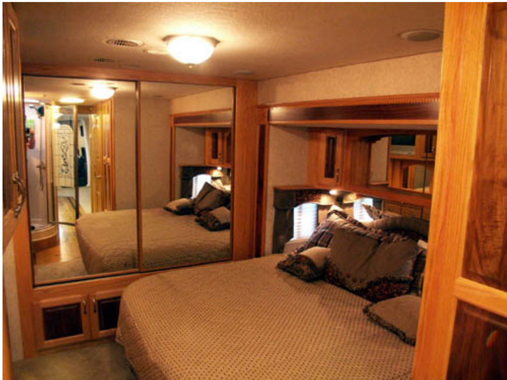
The full rear closet provides tons on hanging and storage space