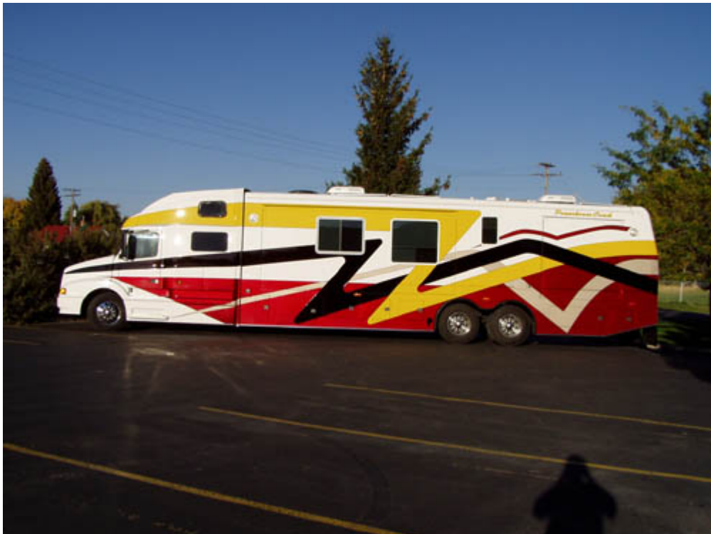
We use lots of custom special effect pearl base coat clear coat paints