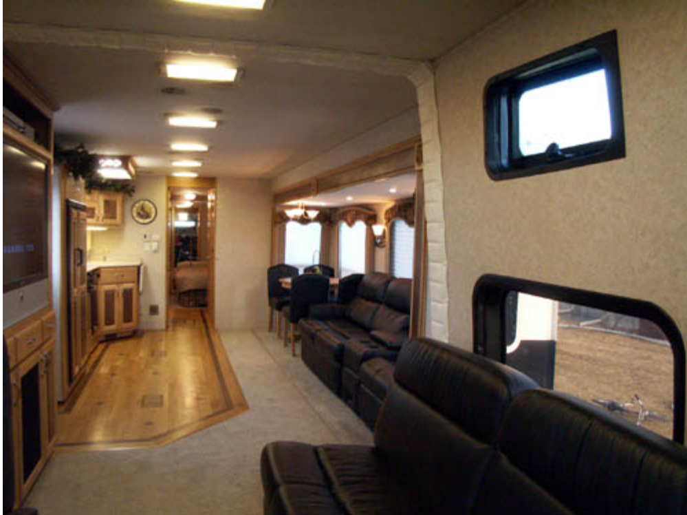
This really isn't an RV its a luxury apartment on wheels