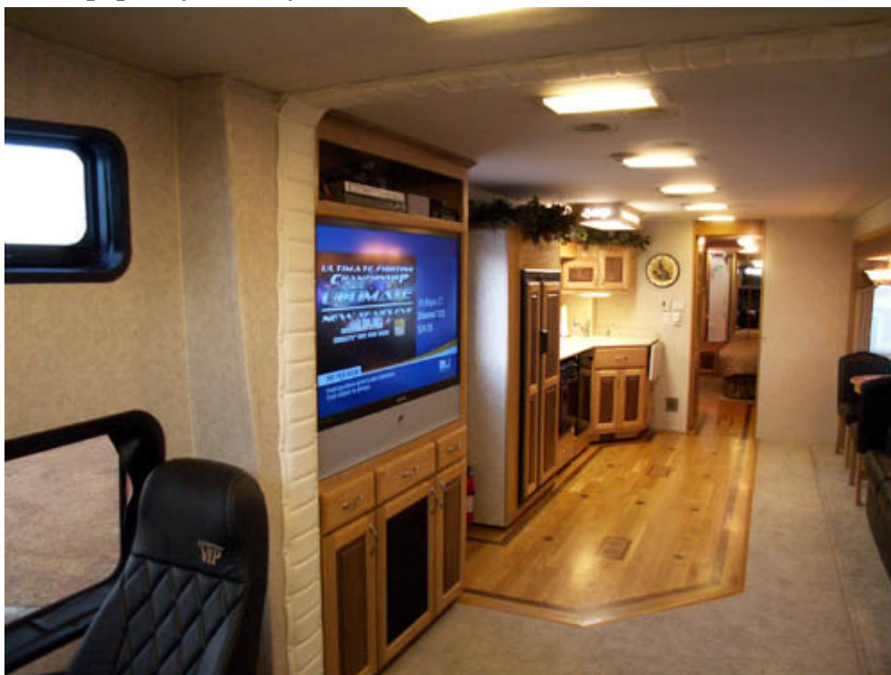
This coach shows our upgraded two species hardwood door package done in Oak and Black Walnut we also offer Hickory, Cherry Stained Hickory, Alder , Knotty Alder Liptous and always adding more