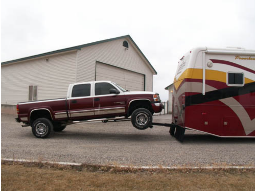
ONLY from Powerhouse Yes that is a full size 3/4 ton pickup