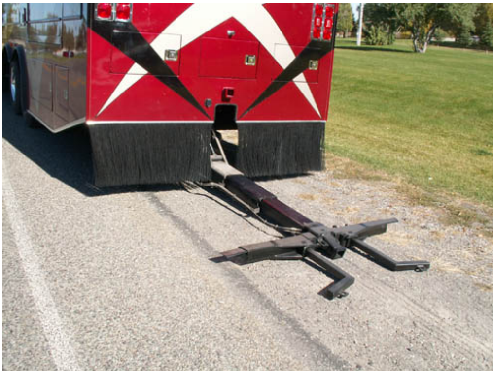
Only from Powerhouse a hydraulics car lift so you can tow almost any vehicle without setting it up special for towing ( how much does it cost you every time you trade tow vehicles and tow bars )