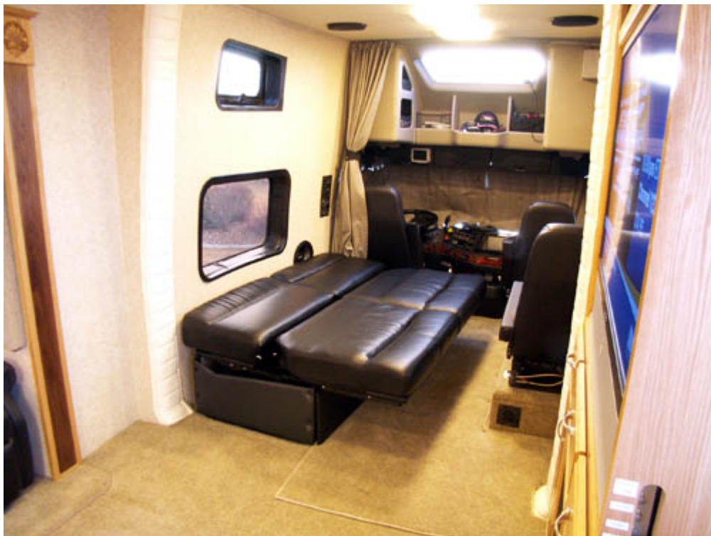
Power jack knife sofa can be separated off for a private front bedroom