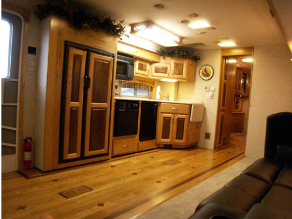
12 cubic foot fridge, convection microwave, full oven and a dishwasher