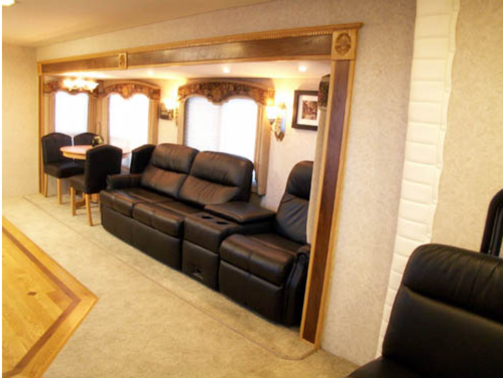
Our living room slide is huge at 16 feet long and 3 feet deep ( 48 sq. ft ) YES that is a power recliner you may have to fight over it