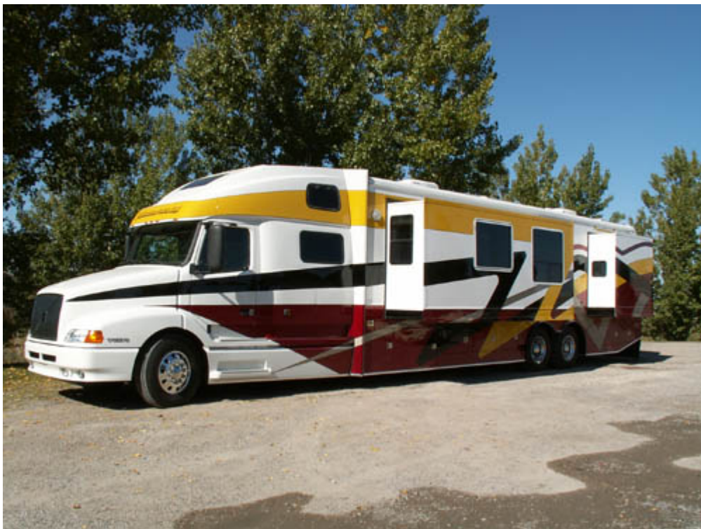
Our living room slide is huge at 16 feet long and 3 feet deep ( 48 sq ft )