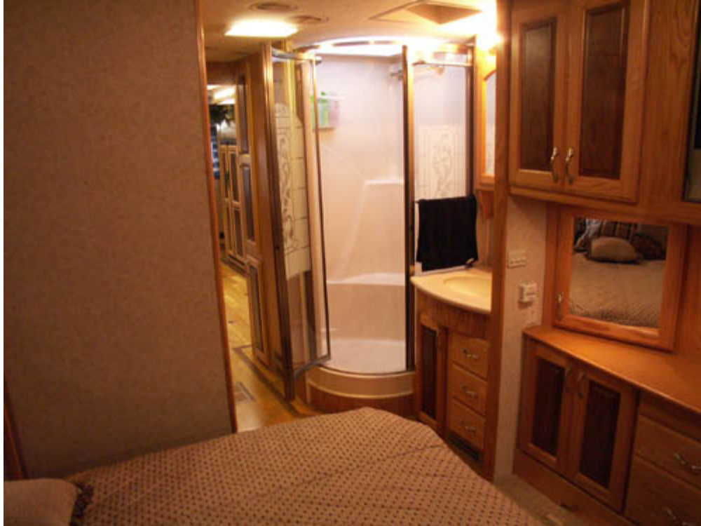
Spacious and tall shower with engraved glass and sky light