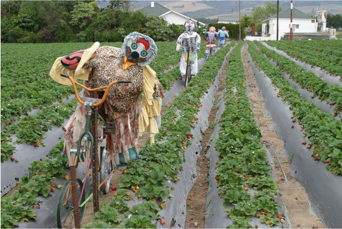
Scarecrows in a strawberry field east of Cape Town. There were at least 50 scarecrows in this field, every one of them uniquely costumed.