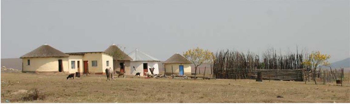
Traditional homestead in the Transkei. This photo was taken in Qunu, the town where Nelson Mandela spent most of his childhood.