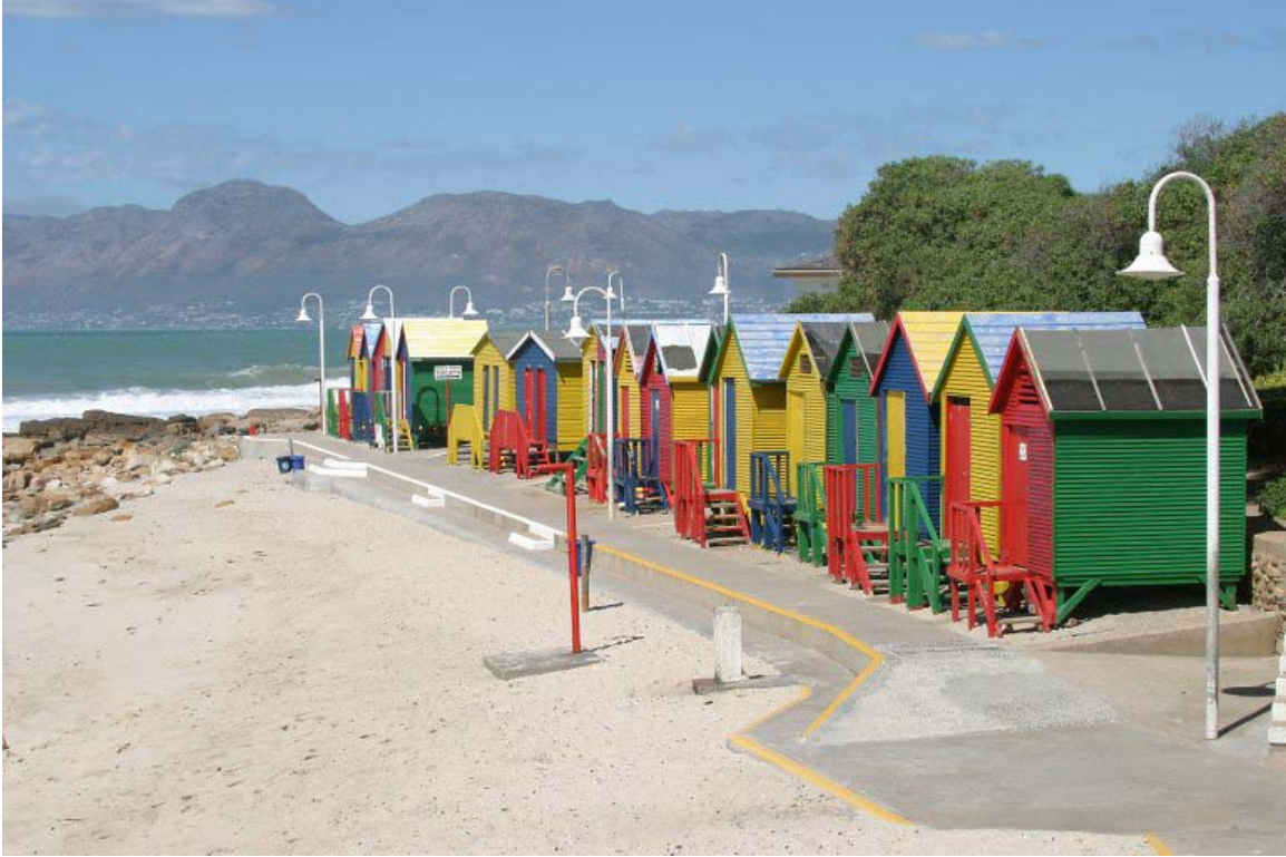
Beach changing rooms on the beach at St. James.