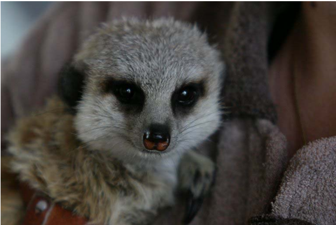
Rosie the meerkat, mascot of the staff at the lion reserve.