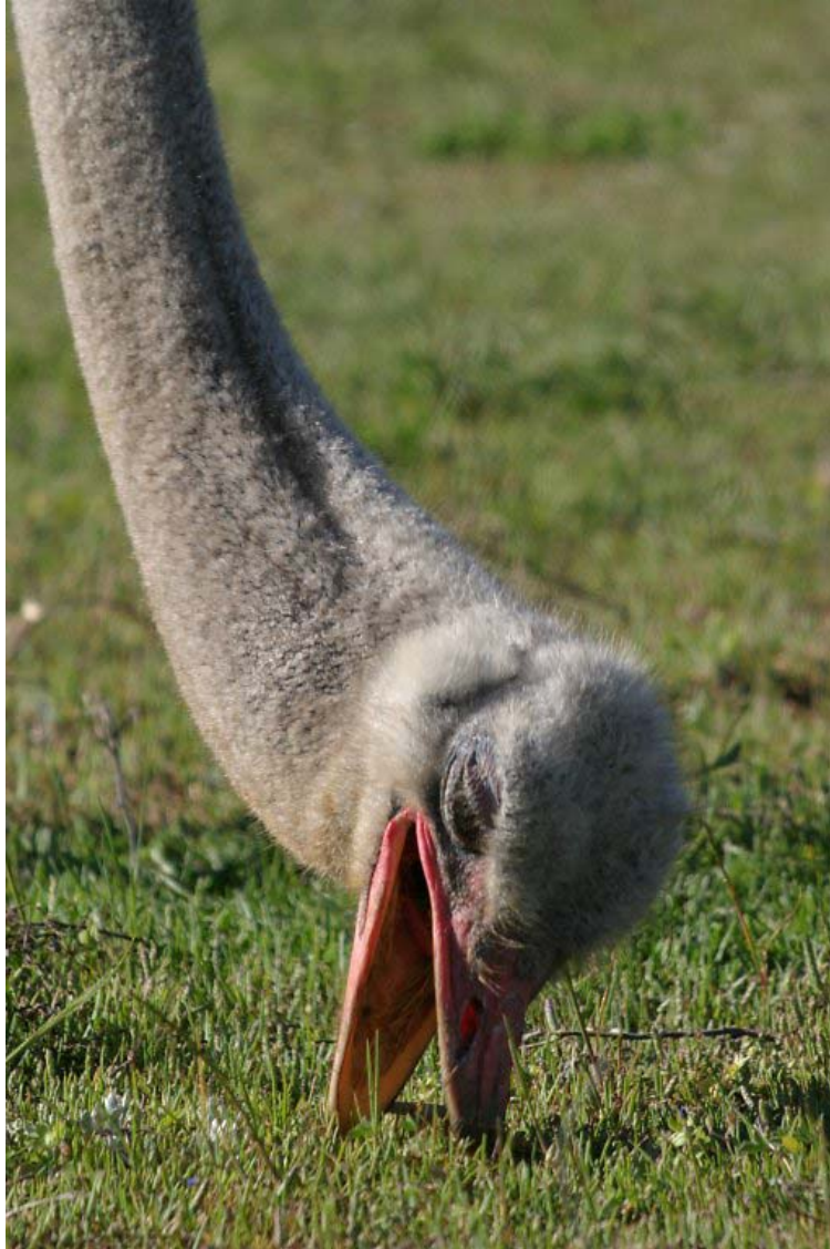
Wild Ostrich eating dinner, Cape of Good Hope National Park.