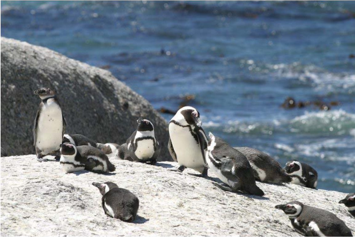
Penguins from the 4,000 strong colony at Simon's town.