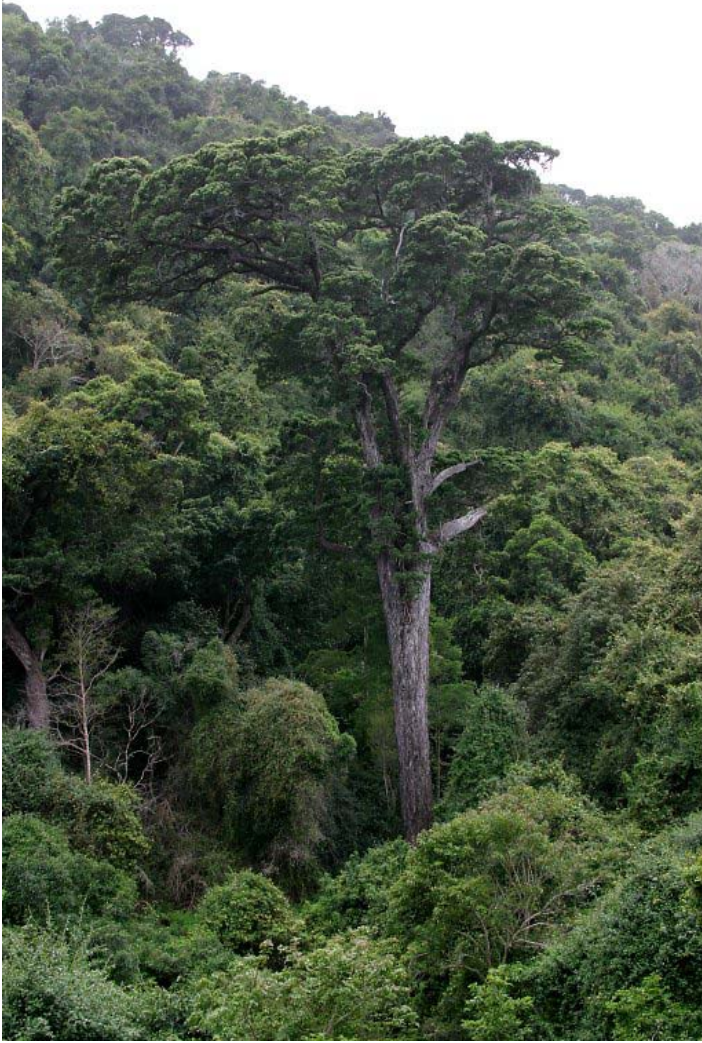
Jungle canopy near Nature Valley.