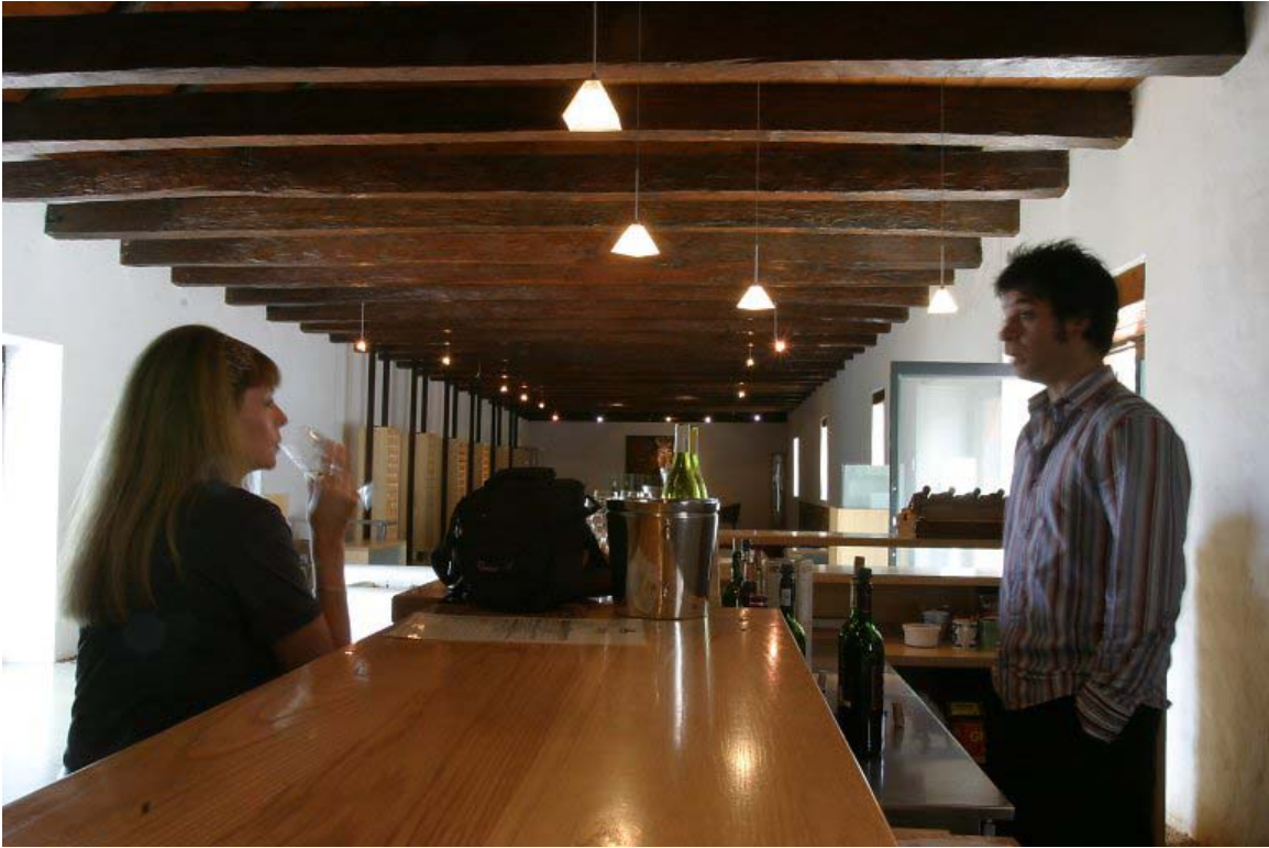
Steph sampling wine in a tasting room built in a 300 year old barn. (1.5 sec, F22)