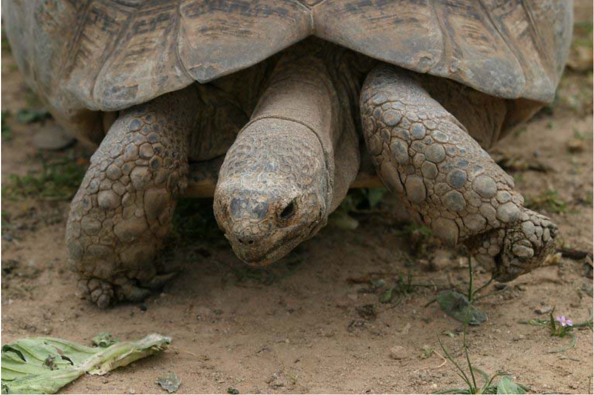
A tortoise who lives at the lion reserve.