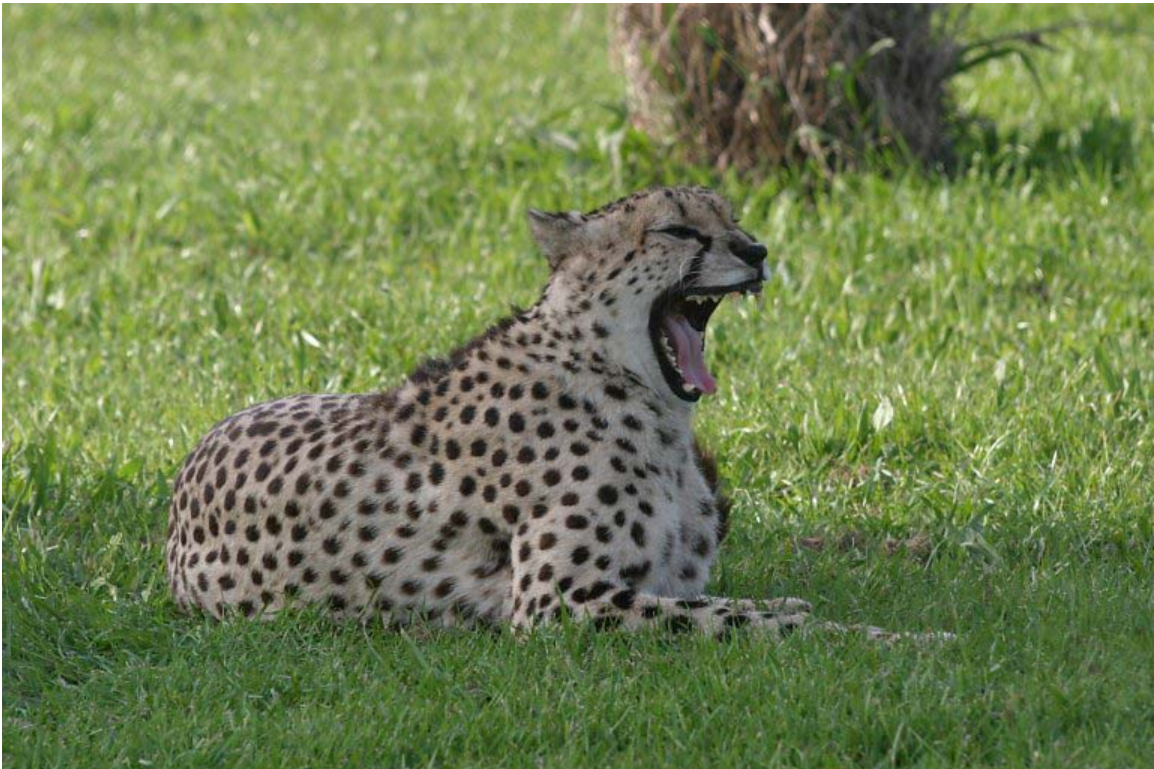
Cheetah yawning in a Cheetah preserve near Cape Town.