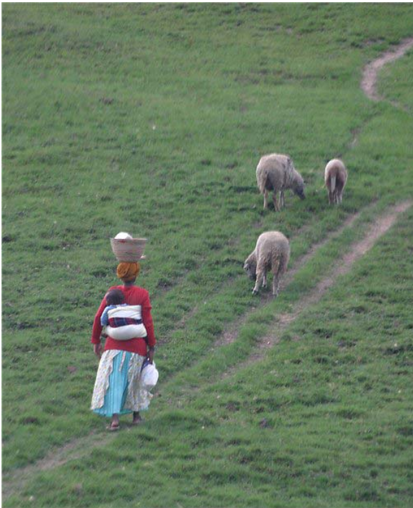
Zulu woman walking home from the market, carrying her baby in a traditional binding. Most heavy loads are carried on the head, with amazing dexterity and balance.