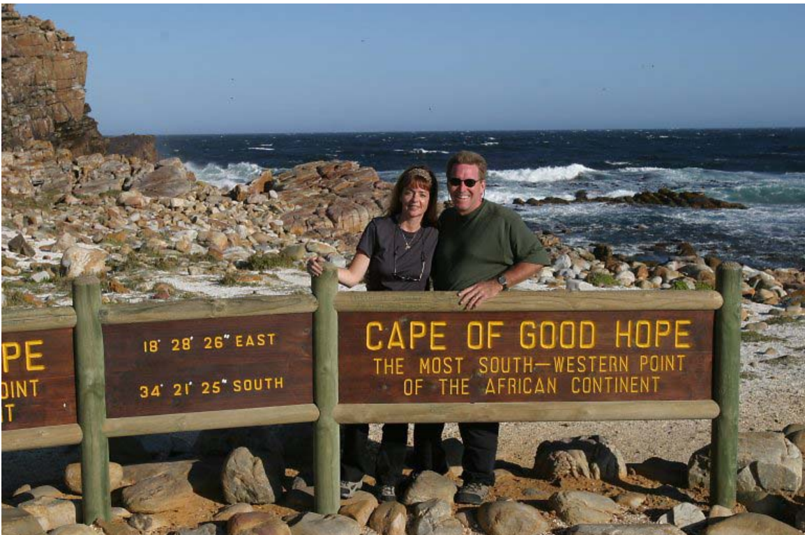
Countless ships met their fate in the stormy waters off this cape, where the warm waters of the Indian ocean collide with the cold waters of the South Atlantic.