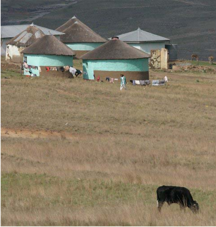
Typical Zulu homestead.