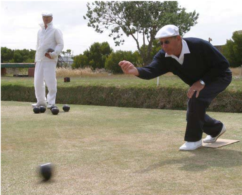
English Lawn Bowling in Wittsan. This club was playing on Saturday morning rather than their usual Saturday afternoon time slot because the national rugby team, the Springboks, were playing that afternoon in the Rugby World Cup. The morning start time allowed them to break tradition and play in clothes other than the traditional all white ensemble typified by the man on the left.