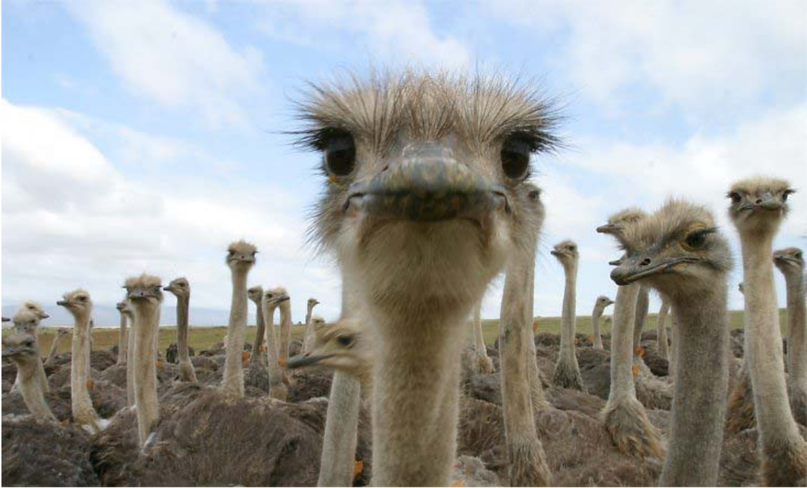
Faces of domestic ostriches, from a field near Wittsan.