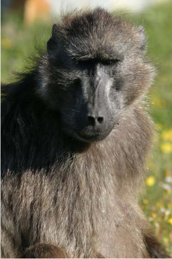
Wild baboons at the Cape of Good Hope National Park eating dinner.