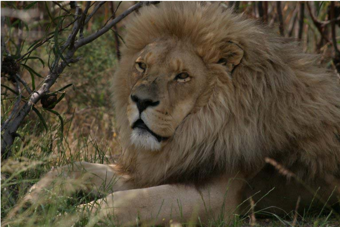
Male lion, lion reserve near Capetown.