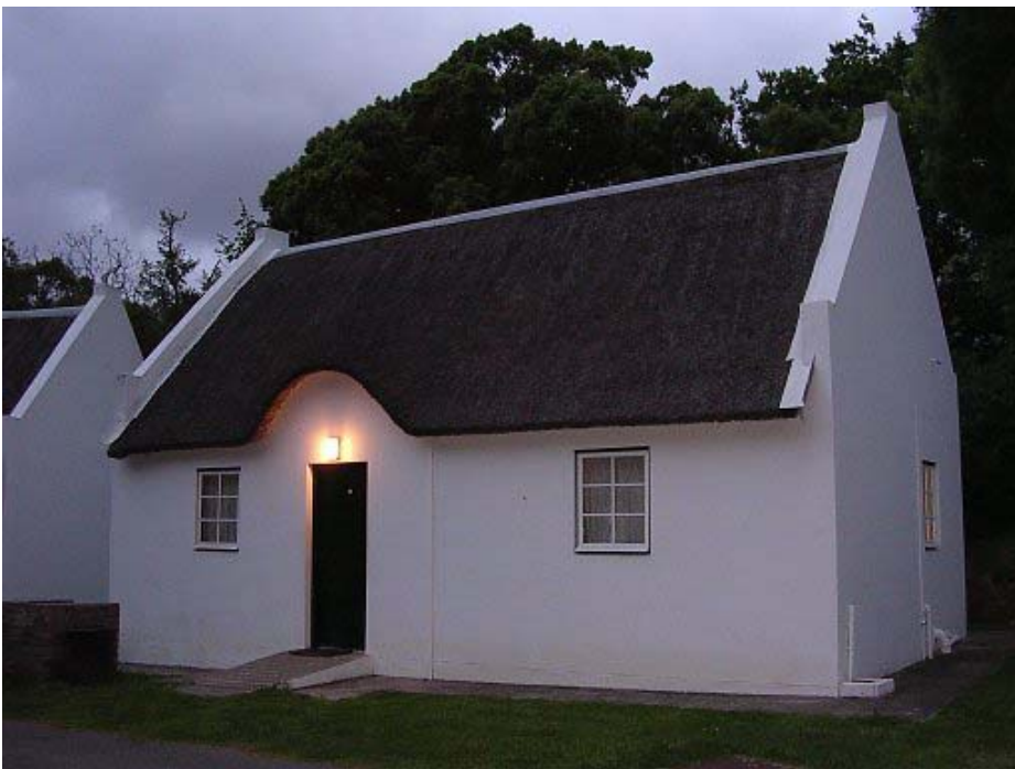
Our thatched roof cottage in Swellendam. (Nikon 3100)