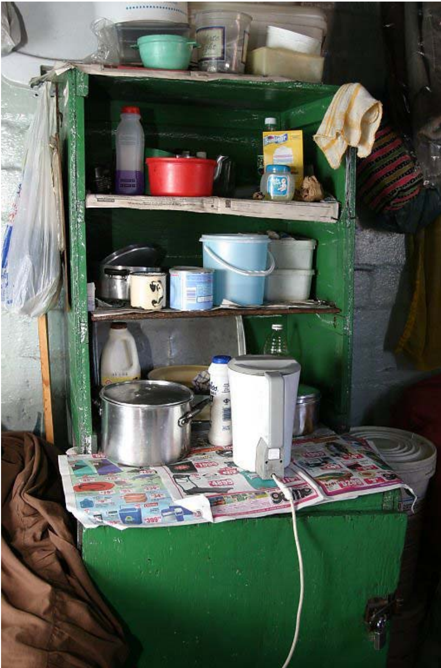
One family's entire collection of cooking utensils and household goods.