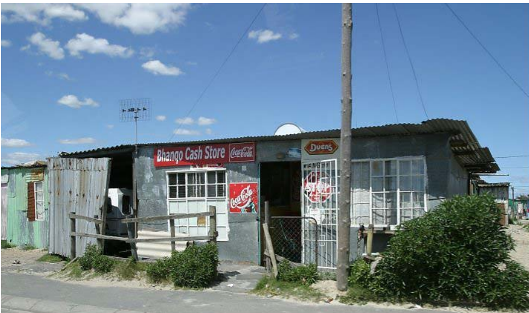
The strange duality of the townships. It is but a shack, but a shack with a pickup in the garage, electricity and a television.