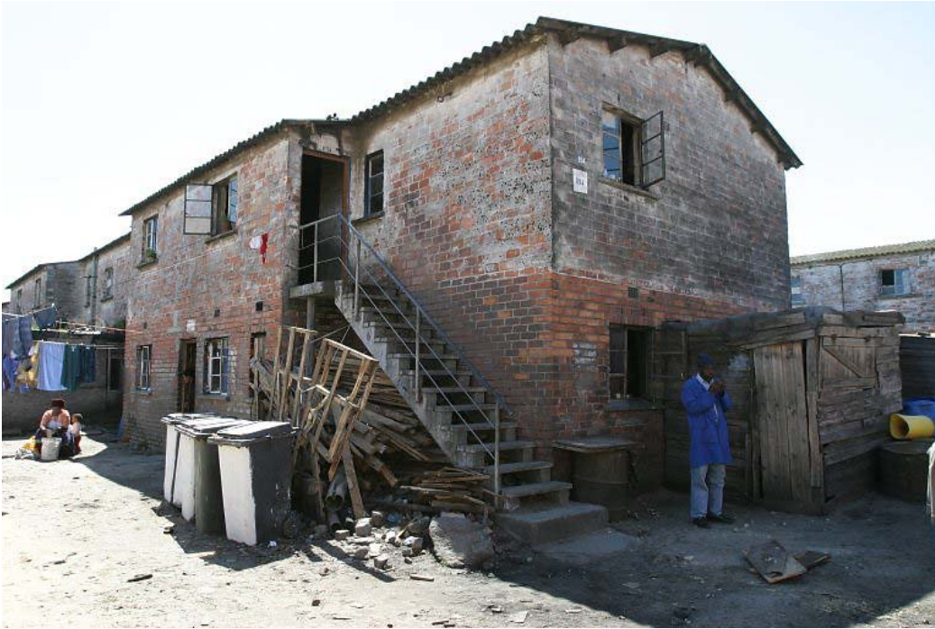
The tenant building we visited. It was built to hold sixteen men, and now houses over twelve families. The man in the blue coat is standing in front of the shack that he and his family live in.