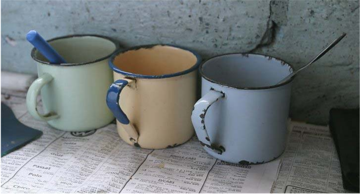
One family's entire collection of cups and silverware.