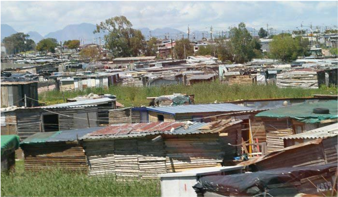
Housing millions of people, the townships stretch to the horizon around many metropolitan areas.