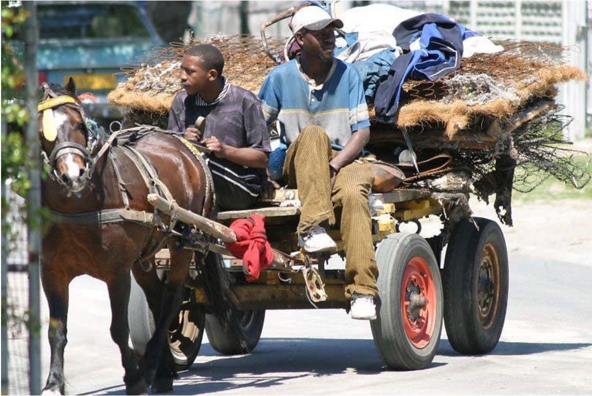
Cars are an economic luxury that many in the townships can only dream of.