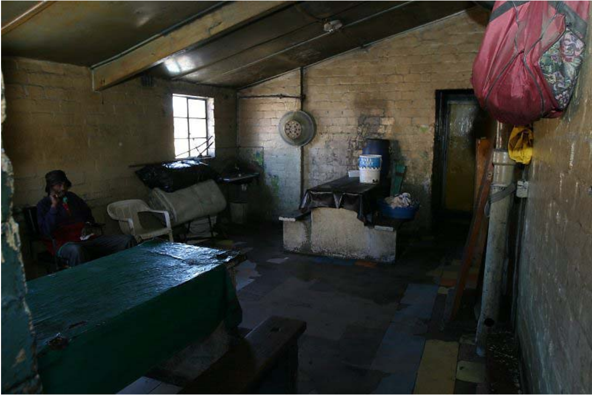
The common room, where six families eat and many of them sleep. The entire 2 nd floor rents for about $2.50 a month and there are months when it can be a financial struggle for the six families to pool that much money together.