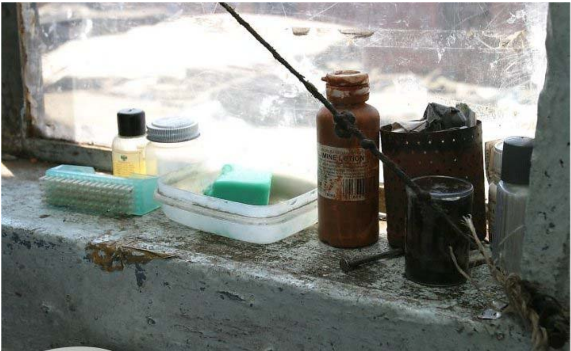
One family's entire collection of toiletries and medications.