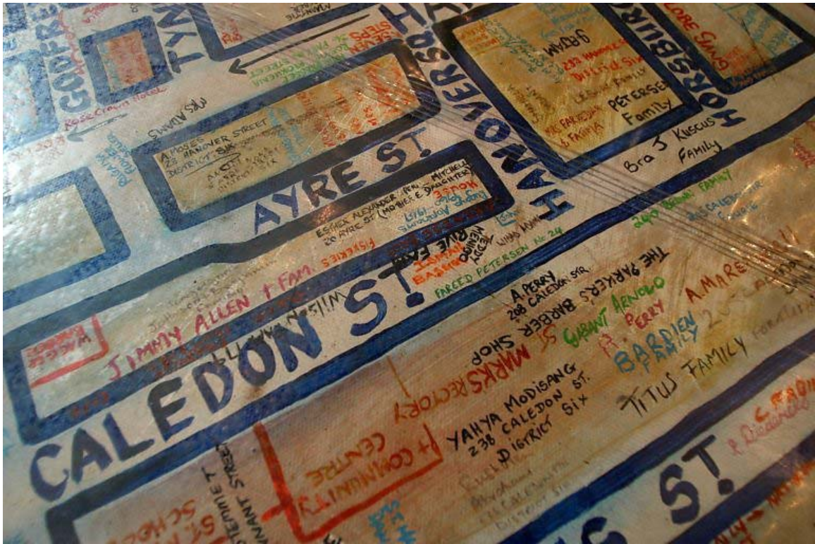
The map of District Six, with notations by former residents.