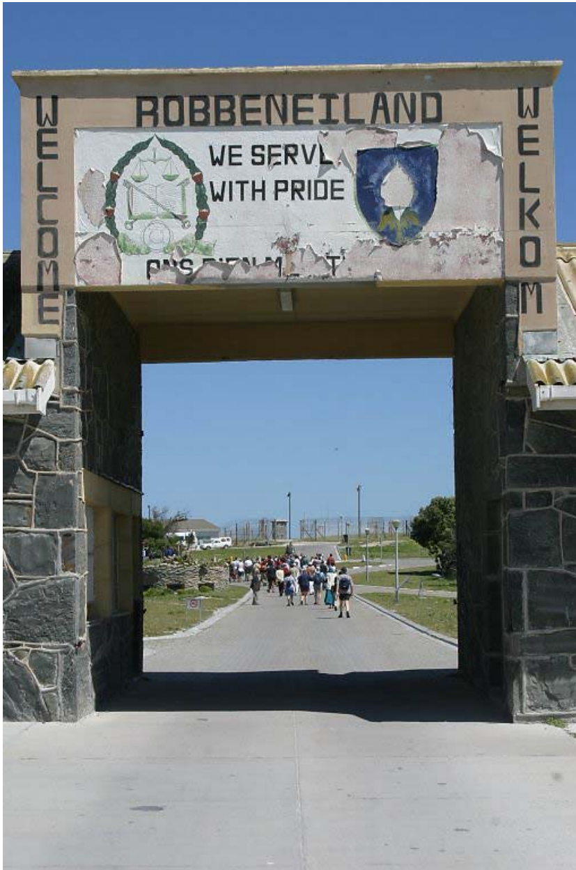
The gate to hell. The entrance to Robben Island, where all suffered and many died.