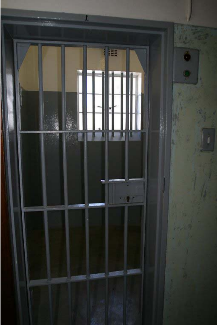
One of the cells in B Block, which held Nelson Mandela and his peers.