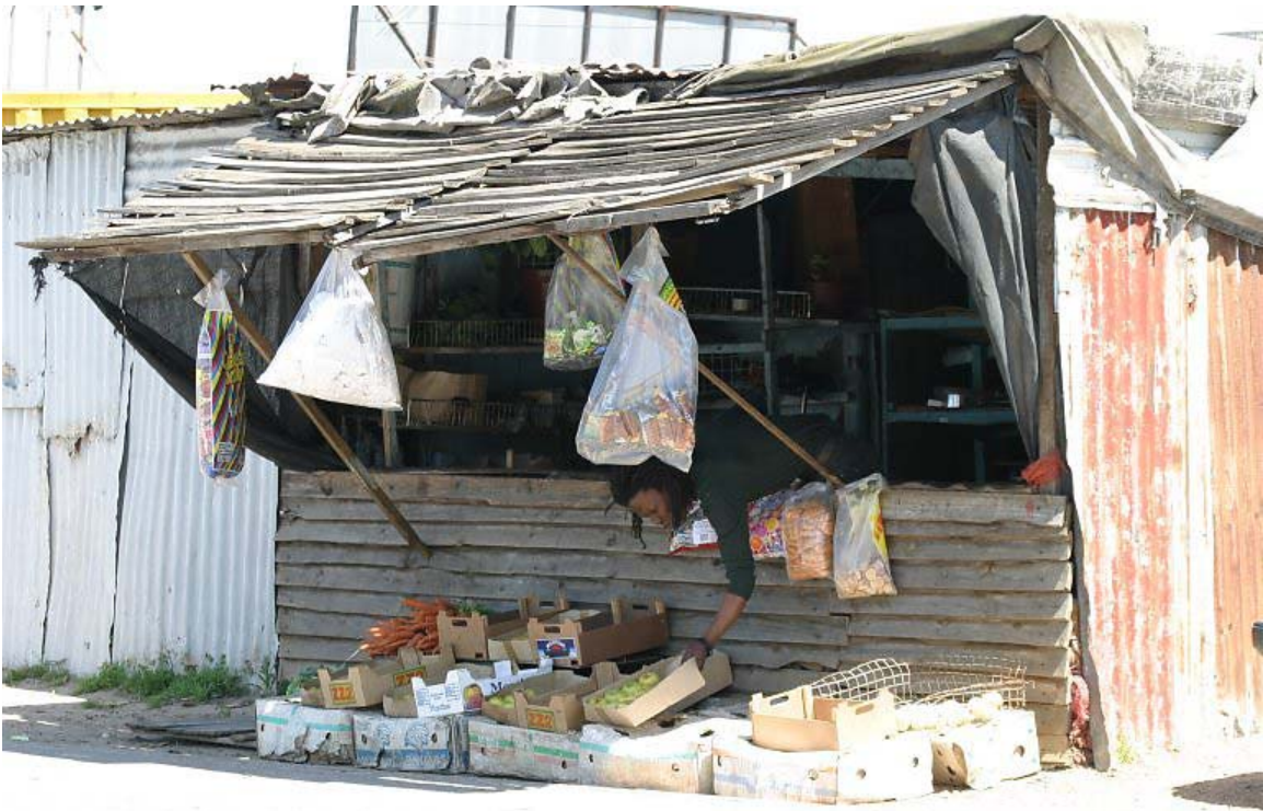
Small township food shops are a critical necessity, as the large, modern supermarkets are miles away.