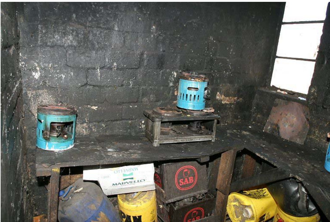
The kitchen, where three families cook every meal.