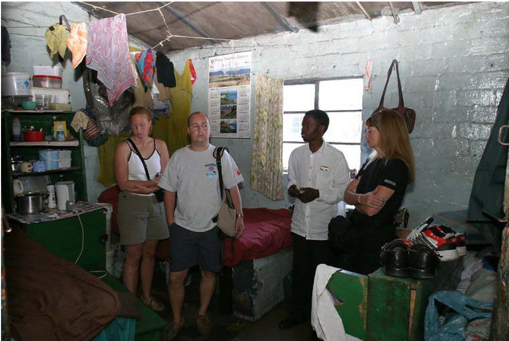
This bedroom is used by three families every night. Anyone who cannot fit into this room sleeps in the common room.