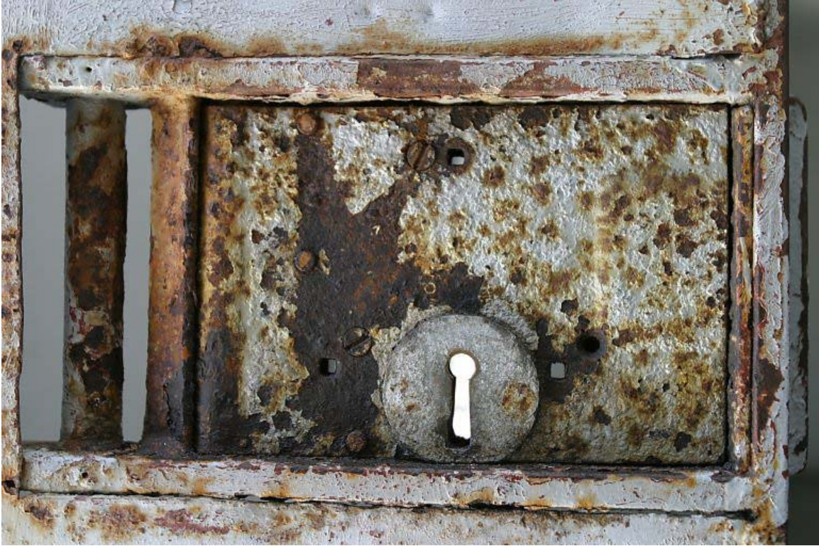
The lock that kept Mandela and his generation of leaders imprisoned.